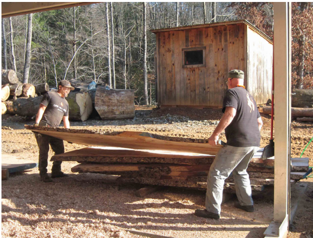
Manually moving thick lumber slabs after sawing on a chain mill

A buffet lunch is provided in the registration fee